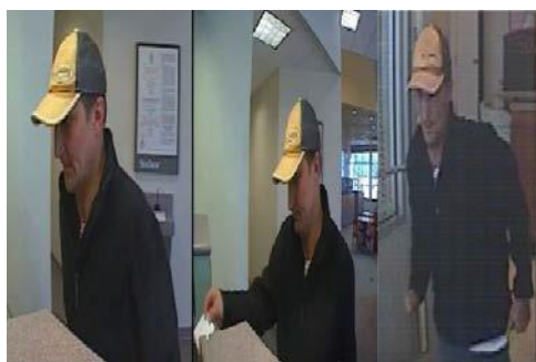
Suspect photos during incident

On July 8, 2017 at 10:30am, the male suspect pictured above entered the Sun Trust Bank located in the 300 block of Charles H. Dimmock Parkway. The suspect passed a note to the teller demanding cash. Upon receiving an undetermined amount of money, the suspect exited the bank and got into a maroon sedan, possibly a Ford Focus. The suspect then drove towards the area of Southpark Boulevard and fled the area.